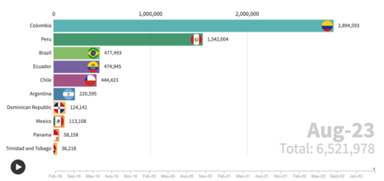
Fig. 2 - R4V Venezuelan population registered by the R4V. (R4V, 2023)

Brazil is seen as a pioneer in the Latin America region when it comes to legislation and policies for hosting and sheltering refugees. There has been an enormous migratory flow of Venezuelans.